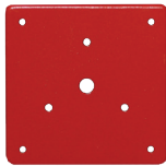
SHMP-R Adapter plate