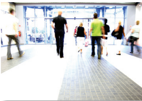
Mass notification systems need intelligible voice commands to guide building occupants to a safe exit.