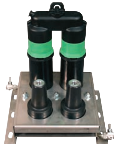
Compact square stainless steel bracket.