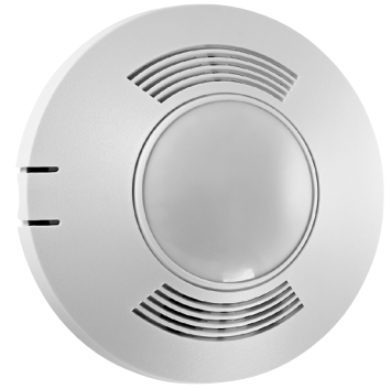
Greengate Ceiling Mounted Occupancy Sensor

The SVHS lighting system upgrades have been so successful that all twenty-one schools in Wayne County are now slated to receive LED fixtures and occupancy sensors. Although the energy overhaul is only newly underway, the district is raking in the savings. In the first three months of the 2014-2015 school year, these energy-saving efforts have returned over $103,000 to the operational bottom line.