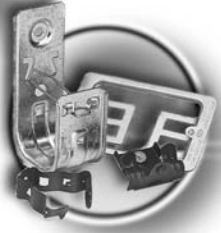
Spring Steel Fasteners