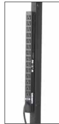
SBEPBZ75 Vertical Mount ePDU

* These units ship with an adapter allowing for 5-20P input plug