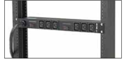
SBEPBZ94 Rackmount ePDU

* These units ship with an adapter allowing for 5-20P input plug