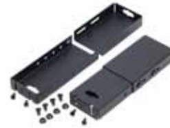
SB3011FB Mounting Bracket