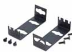
SB3010FB Mounting Bracket