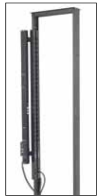
ePDU Vertical Application