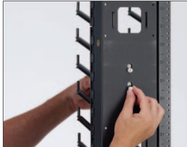
(5) Tighten the nylon nuts.