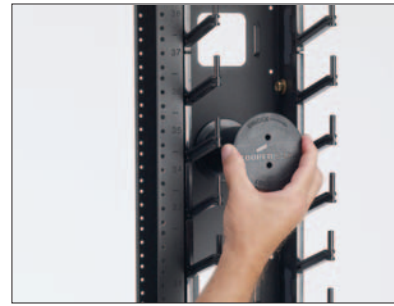
(3) Insert the nylon nuts through the keyholes in the vertical cable manager.