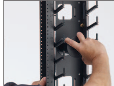
(6) Twist clockwise to unlock spool slide.