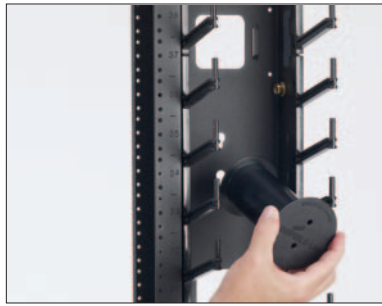
(2) Determine the proper mounting height on the vertical cable manager.