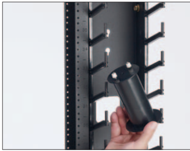
(1) Loosen the nylon nuts on the back of the spool.