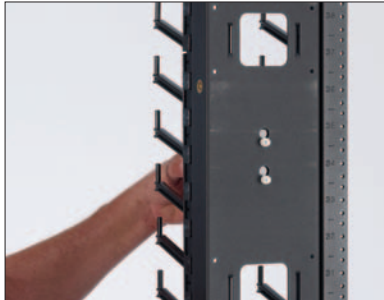
(4) Slide the spool down so that the nuts are in the bottom of the keyholes.