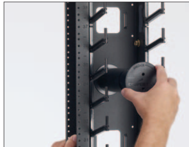
(7) Pull sleeve outward and turn counter-clockwise to lock.