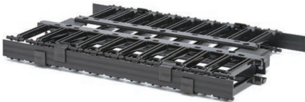
SB87019D1FB Standard (2U) Length