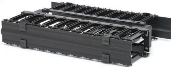
SB87019D2FB Standard (2U) Length