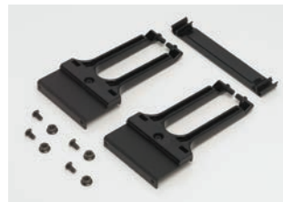
Gates & Hardware