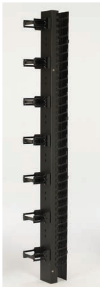
Back Gate Kit 6" wide SB86306GK