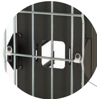
Mounted On Cable Manager