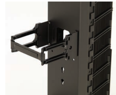
Gates & Hardware Installed