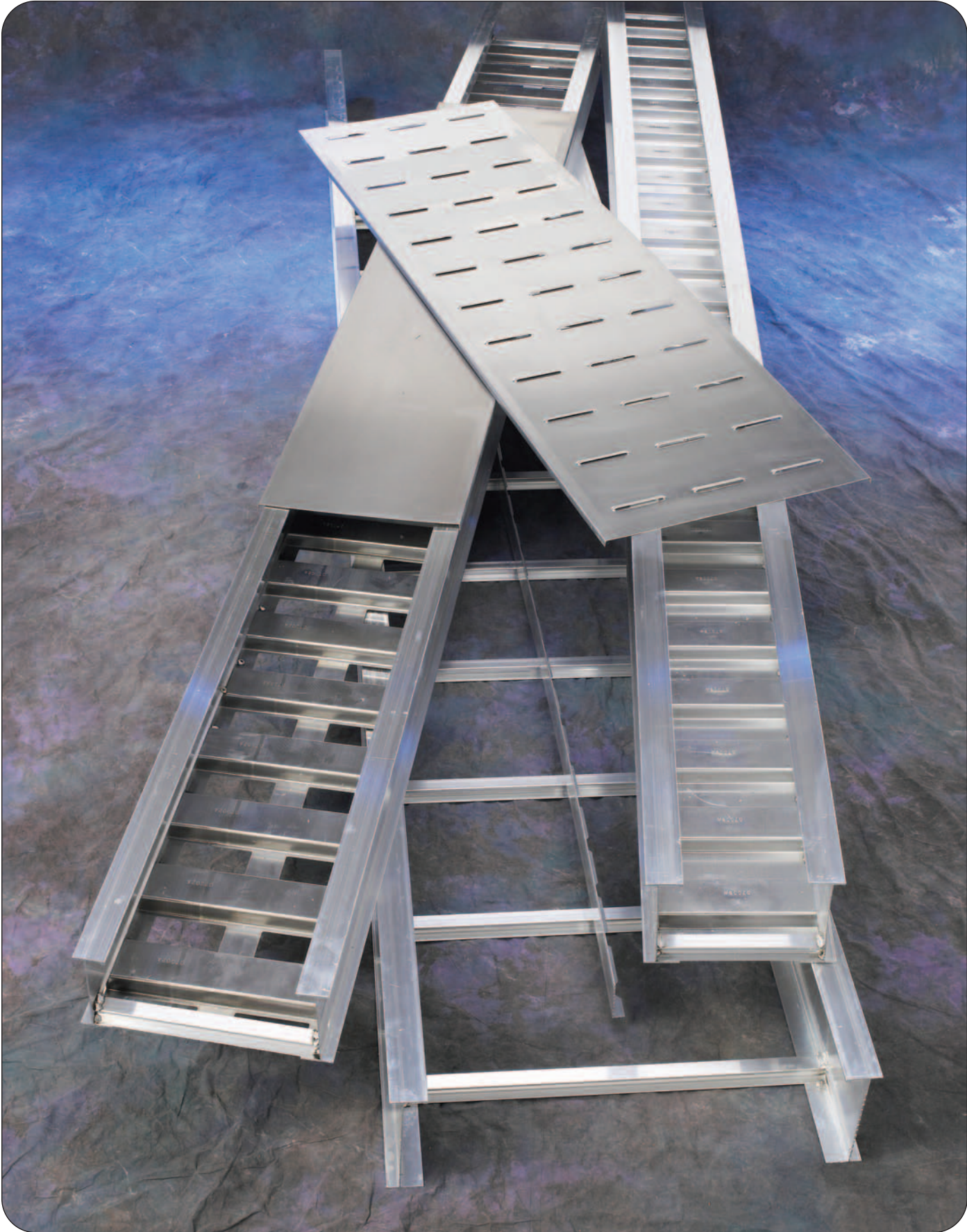
Series 2, 3, 4, & 5 Aluminum