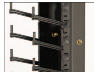
Sloped Fingers & Captive Mounting Nuts