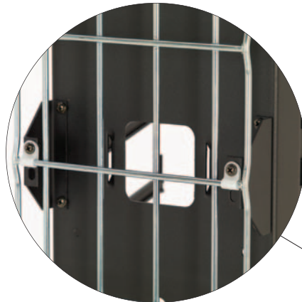
Mounted On Cable Manager