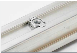
Dove-Tail Twirl Nut™