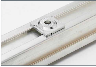
Dove-Tail Combo Nut Washer