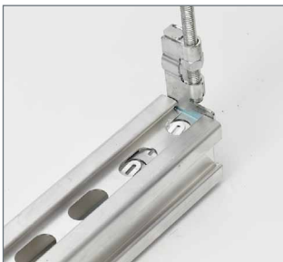
Flip Clip™ Trapeze Solution