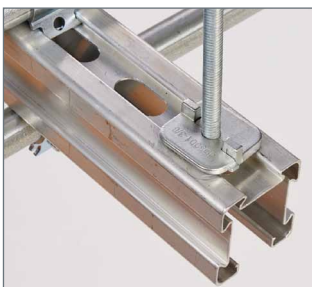
Turn and Lock Trapeze Solution