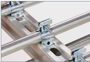
Pipe Clamp (shown in dove-tail side)