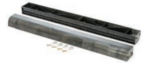
HDDODFB Rack Drop-Outs and Runway Mounting Brackets