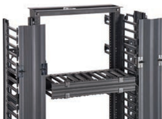
RCM+ Vertical and Horizontal Cable Managers