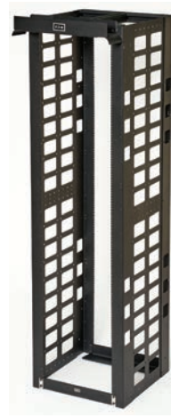
HD2T7BFB Cable Management Racks