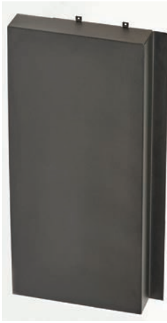
HDAB7BFB Low-Profile Air Baffles